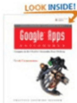
Google Apps Deciphered: Compute in the Cloud to Streamline Your Desktop

Amazon.com has new recommendations for you based on items you purchased or told us you own.