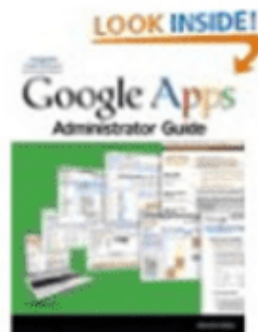
Google Apps Administrator Guide: A Private-Label Web Workspace